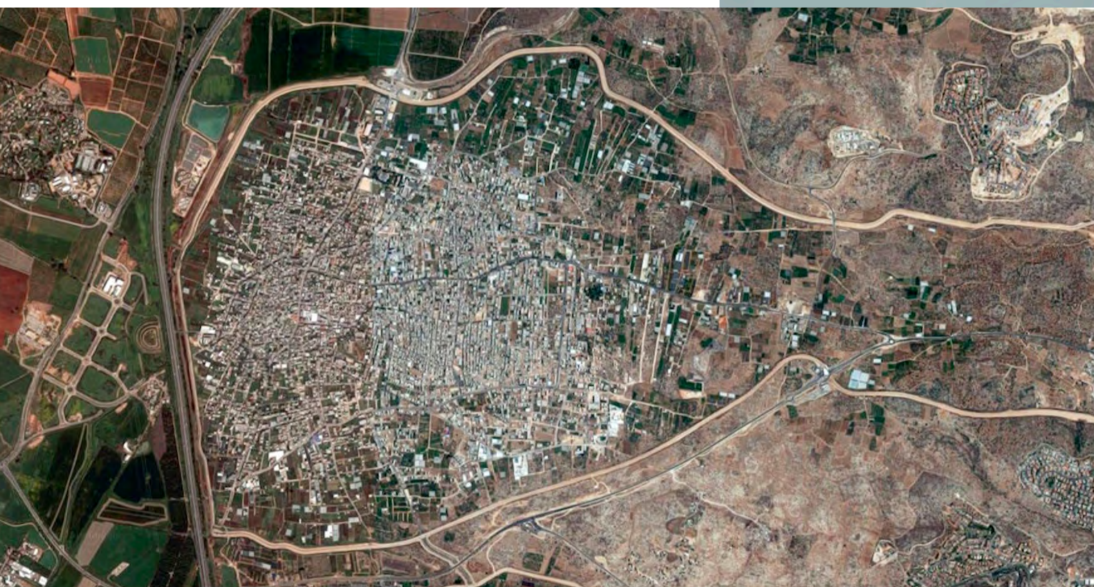
Mary and Joseph may have lodged in the ancient city of Qalqilya .

Israel has now almost encircled the city with its Separation Wall, cutting off the population from most of their ancestral lands which have largely been taken over by settlers.