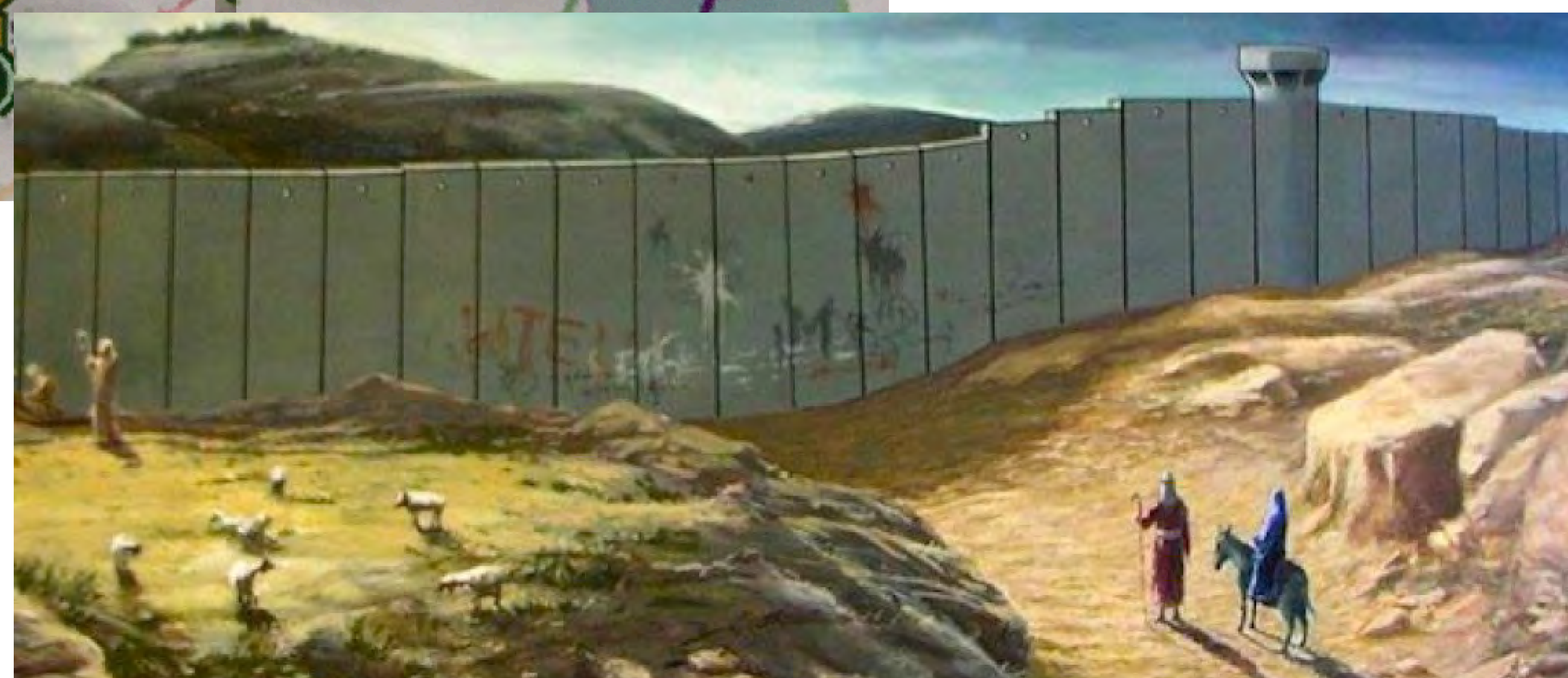
At the end of their journey, would today's Mary and Joseph get through The Wall ? The Open Bethlehem organisation says: " The Wall encircles Bethlehem... with the land isolated by the Wall, annexed for settlements and closed under various pretexts, only 3% of the Bethlehem district is available for Palestinian use. "