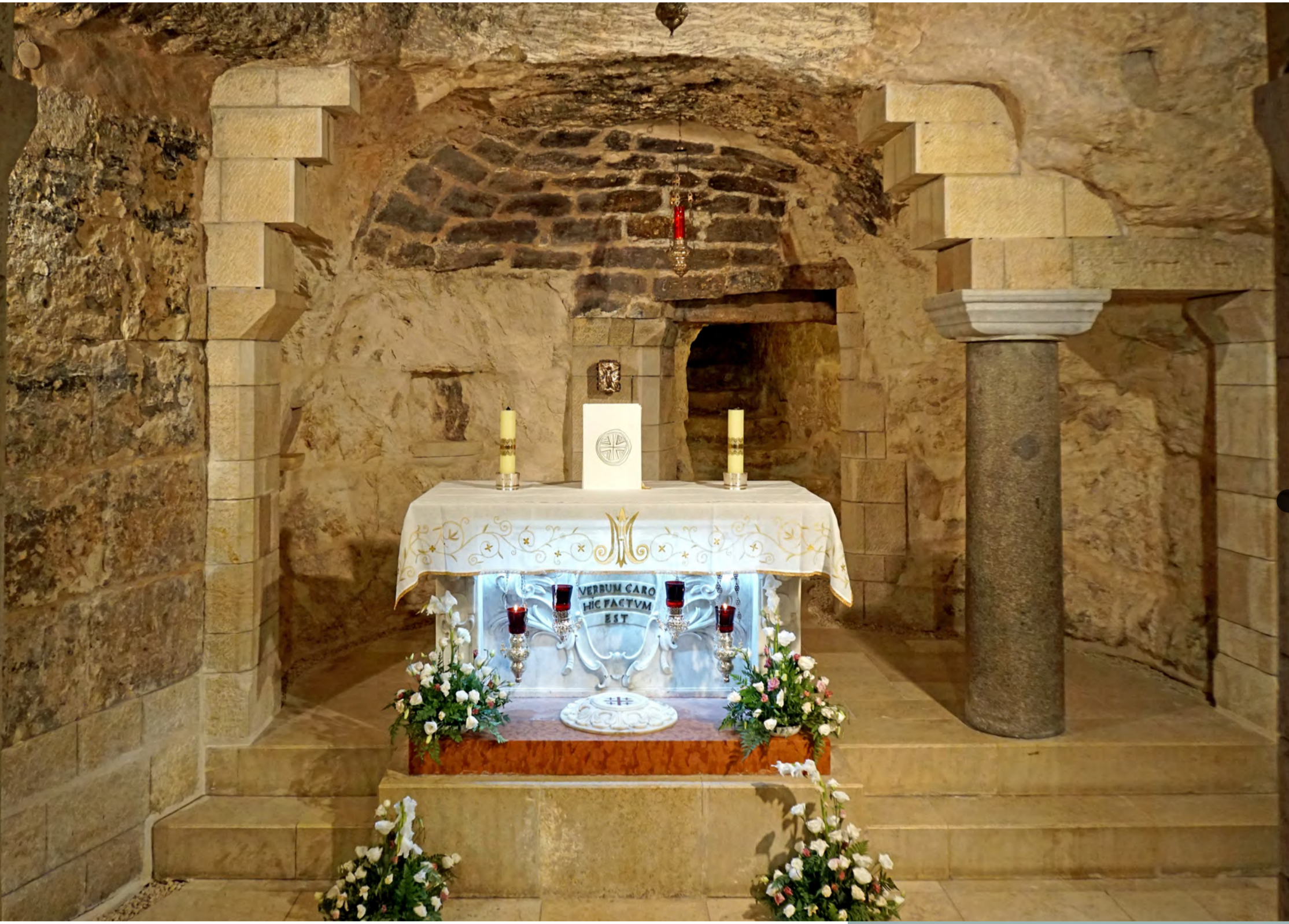
The Holy Cave in the Basilica of the Annunciation in Nazareth, believed to be where the Angel Gabriel appeared to Mary.

Nazareth is the largest Palestinian city in Israel and about 30% Christian.