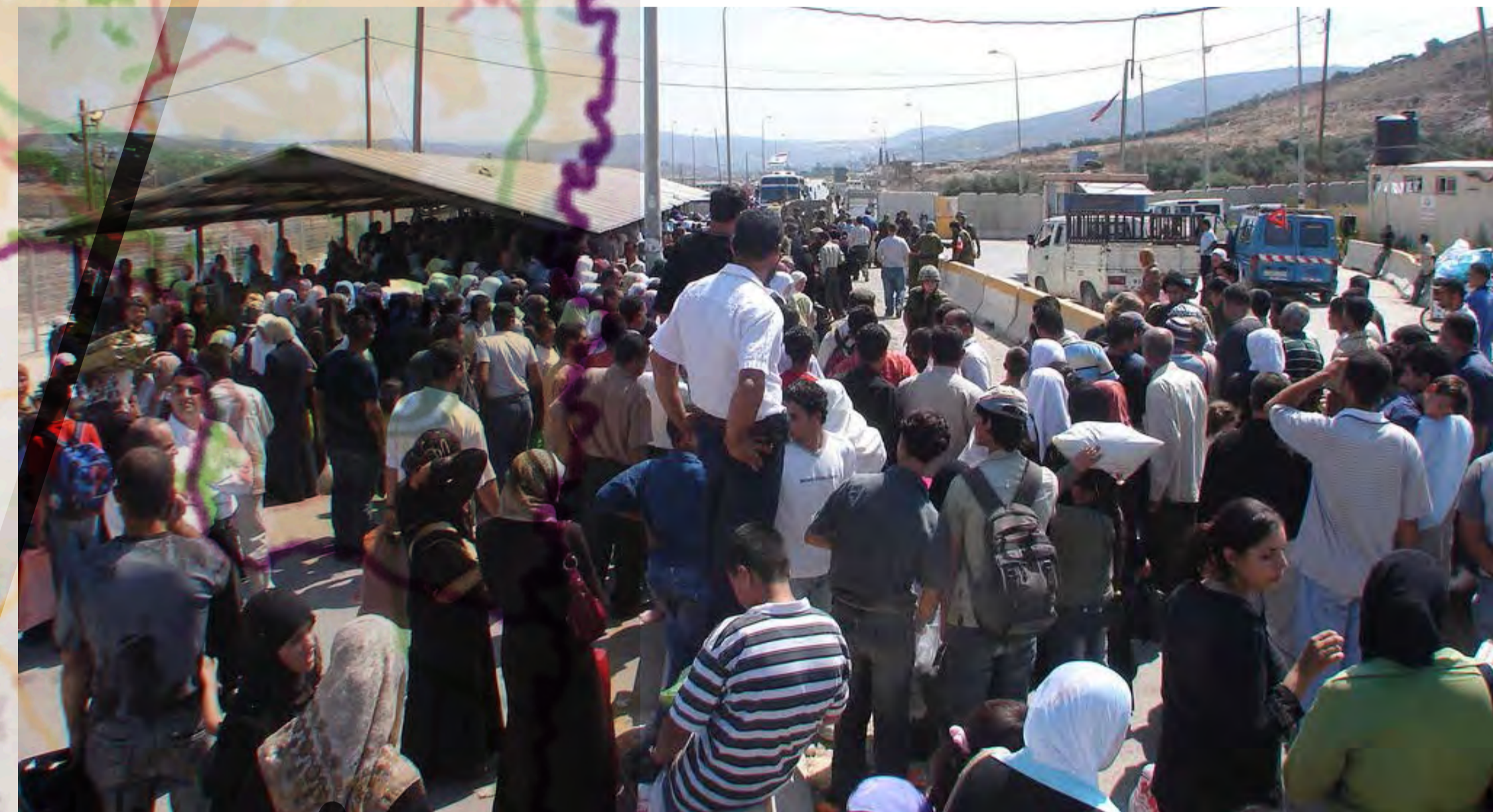
Today's Mary and Joseph would have to pass through three Israeli military checkpoints, including this one at Huwwara . Palestinians must queue for hours and scores of babies have been born at checkpoints.