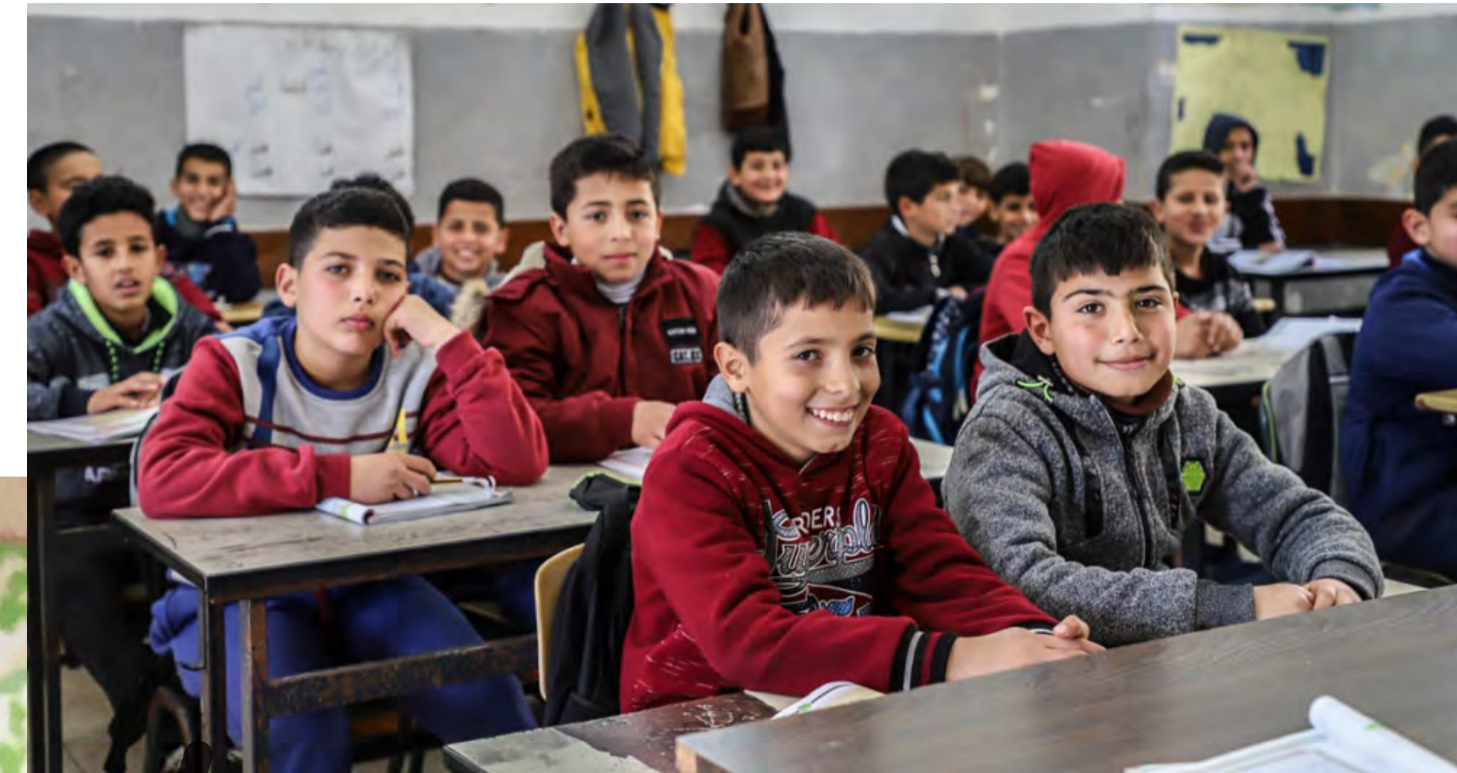
Life is frightening for children living under military occupation. Children at this school near Nablus are taught emergency drills to deal with frequent raids on their classrooms by Israeli soldiers and armed settlers.

Nazareth is the largest Palestinian city in Israel and about 30% Christian.